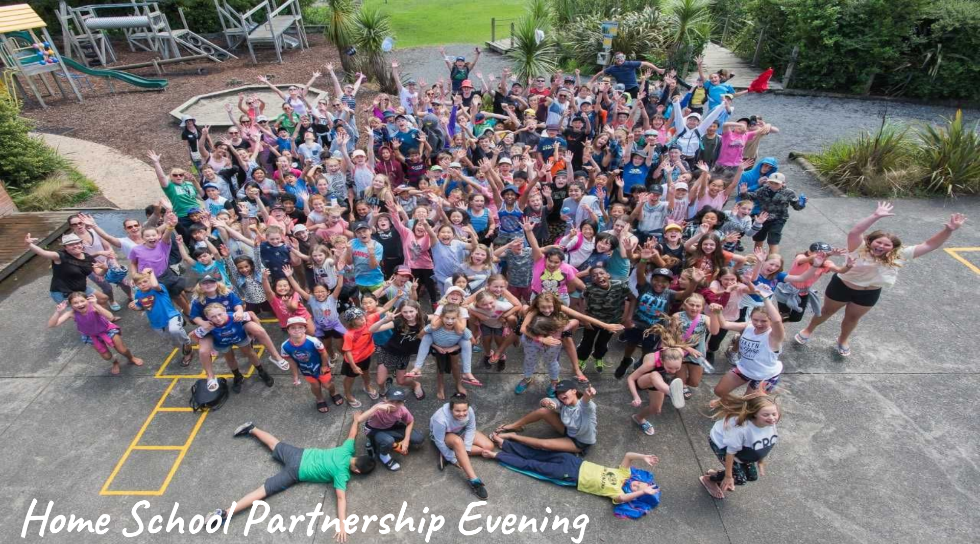
Home School Partnership Evening