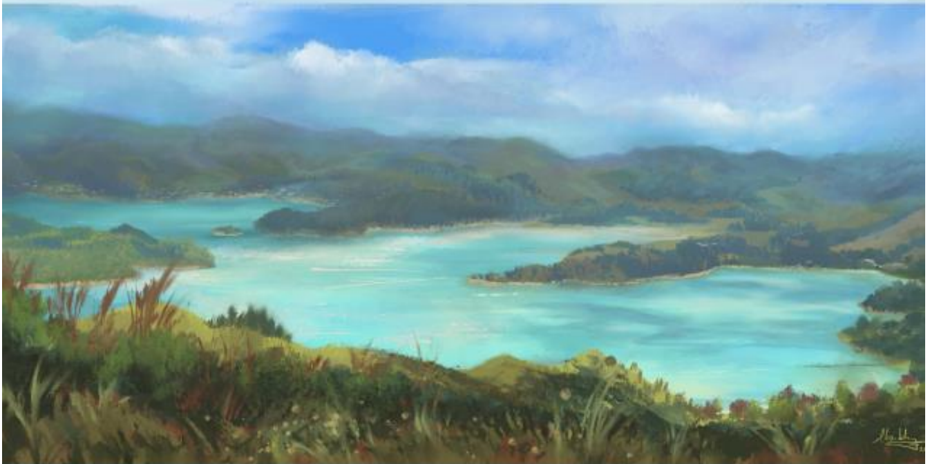
Chloe Or, 'Views from Port Hills', Digital painting, 2021