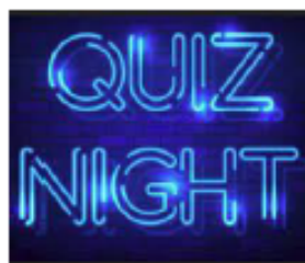
QUIZ NIGHT September