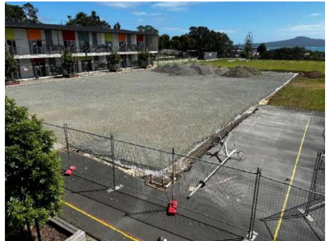
Astro Turf under construction